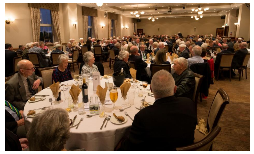
A full House-230 Guests